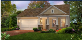
THE CRAFTSMAN MODERN