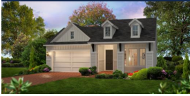
THE FARMHOUSE MODERN